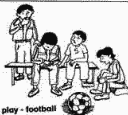
play - football